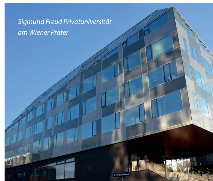
Sigmund Freud Privatuniversität am Wiener Prater

see hotel list on our website: www.highereducationlaw.eu